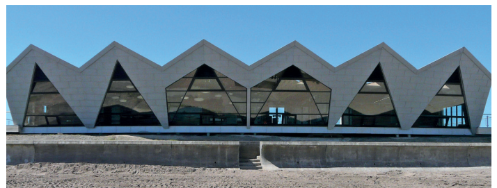
North Sea Observatory, Chapel Point

Over 350 people gathered to celebrate the awards and were welcomed by guest speaker, Homes Under the Hammer presenter, Martin Roberts.