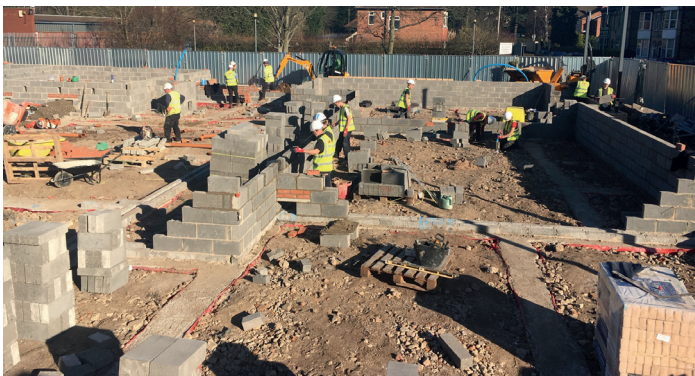
Apprentices working on site at North Marsh Road

Gelder Group's Mission is to 'Inspire a new generation in construction' and this scheme of 24 high-quality flats for the over 55's being situated so close to the towns Gelder sponsored Construction Career College, gives the opportunity for the company to do just that. Gelder Group is a huge supporter of apprenticeships and bringing on young talent. Currently there are 6 apprentices on site but these numbers will increase as the project progresses.