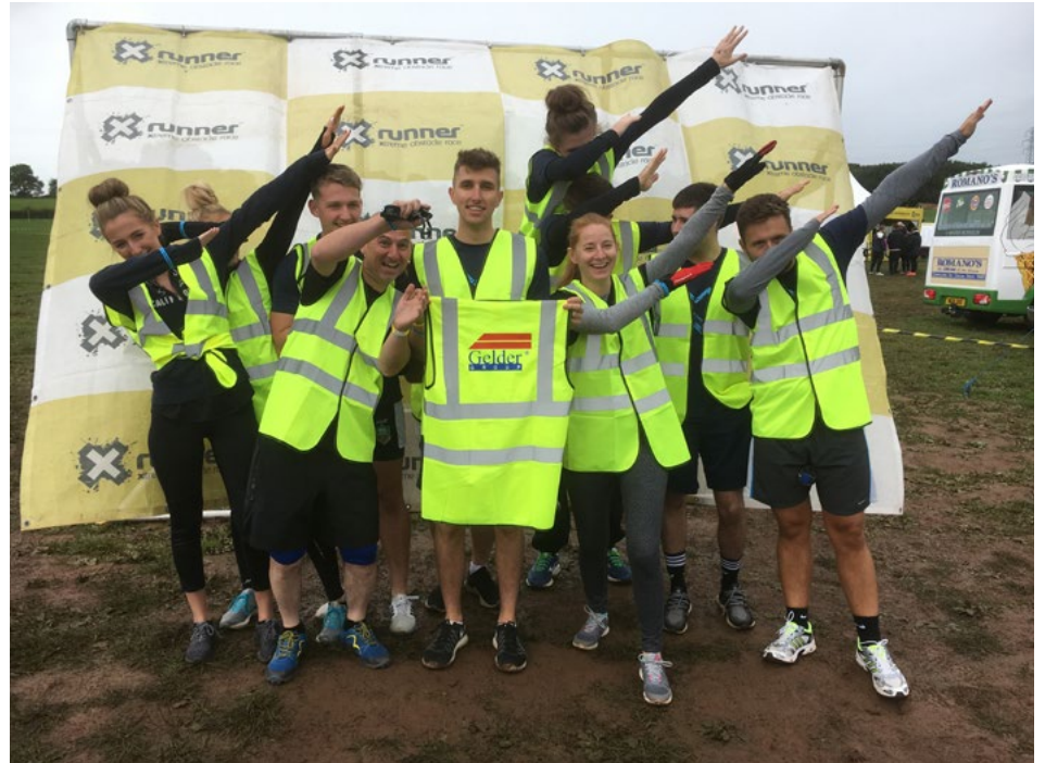
The Gelder 'Wild Warriors'