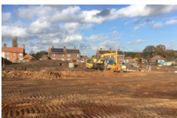
Work commences at Knaith, nr Gainsborough

The next development will be 16 properties in Kirton-in-Lindsey, due to commence in January 2019.