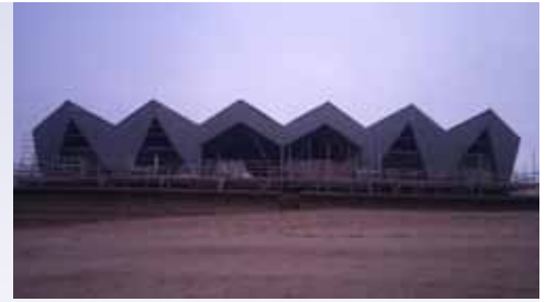
Pictured: The North Sea Observatory viewed from the Chapel St Leonards beach

Pictured left: A local resident gets a sneak preview of the new iconic marine observatory!