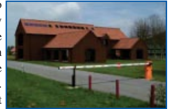
CORE Artist impression

Incorporated into the two storey building will be a training room to showcase the above technologies. CORE's aim is that this showroom of renewable energy solutions will enable individuals and businesses to make accurate, sustainable and cost effective decisions to reduce their carbon use.