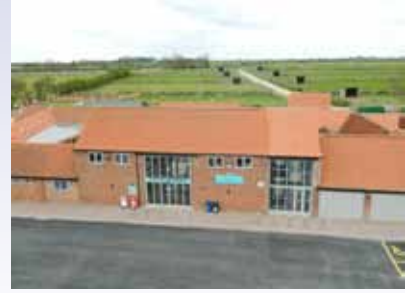
Pictured: The New Visitors' Centre